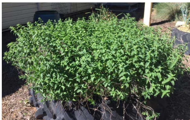
Mint is a rich source of vitamins A, C and B2.

Please help yourself to mint this week, it is great in salads, ice cubes or as a condiment with your lamb roast, or why not plant a hardy echeveria in an old container or pot. At just $1 or $2 each depending on size, these succulents are very easy to propagate so are well worth the money. Margot will be at school at 3:20 pm each day this week or call her on 0407 658 401 to reserve yours.