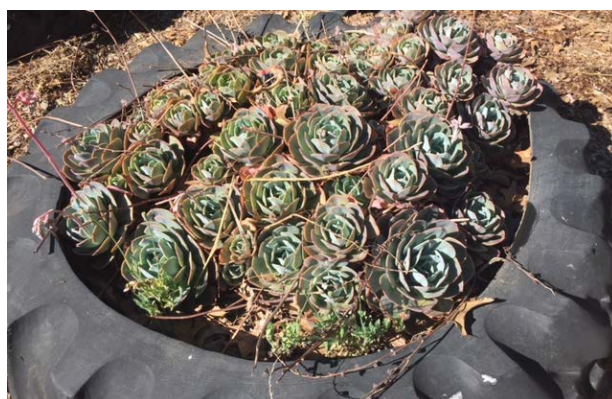
Echeveria are hardy succulents that thrive on neglect.

School Pick Up – A couple of near misses have been reported recently at school pick up time on Swift Street. It is a busy area and time of day, with many buses and cars leaving. Parents and carers are reminded to use the crossing on Swift Street when collecting their children from school in the afternoon.