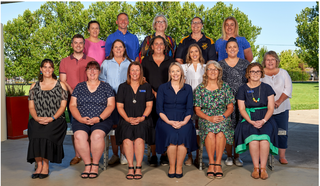
2023 Holbrook Public School Staff

Teacher at Holbrook Public School for 32 years