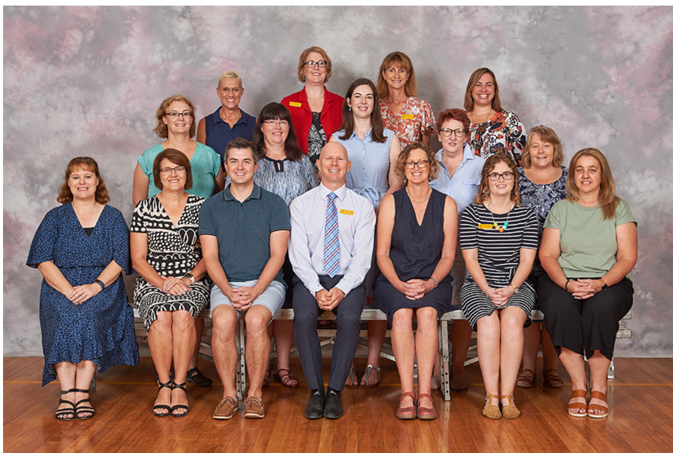
2020 Holbrook Public School Staff

Teacher at Holbrook Public School for 29 years